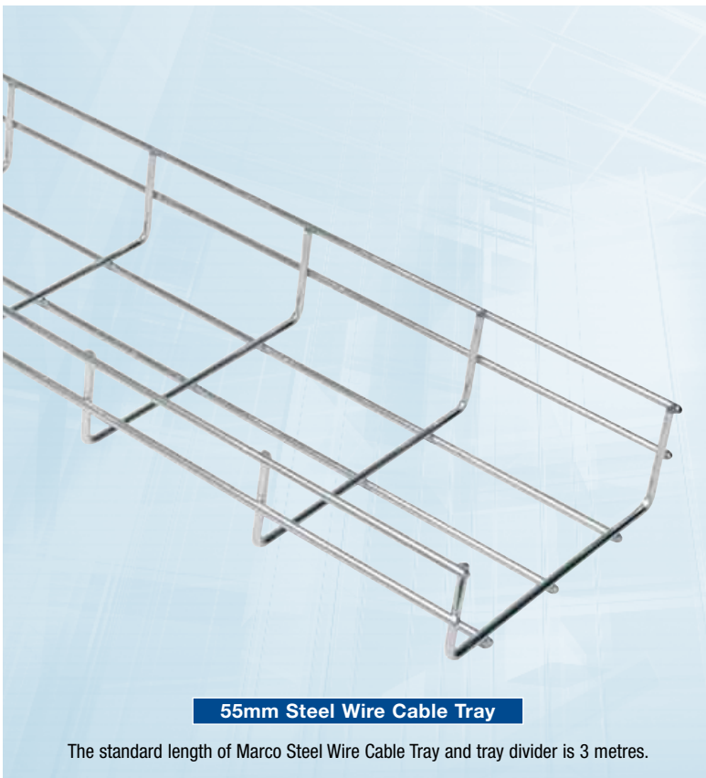
55mm Steel Wire Cable Tray

The standard length of Marco Steel Wire Cable Tray and tray divider is 3 metres.